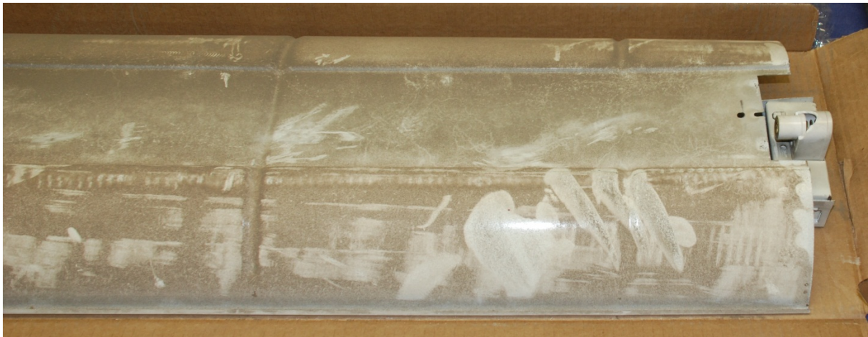
Hand/Finger marks where the worker came in contact with the light shroud.

A healthy and very active, middle aged husband and father, was performing his job of installing a drain line, near ceiling height, inside a commercial warehouse. While in the process he came in contact with an ungrounded metallic shroud of an energized fluorescent light fixture. The worker, who was on scaffolding, received an electrical shock. The electrical shock was of such a magnitude that the worker's leg muscles contracted and he was propelled off the scaffolding to the concrete floor below.